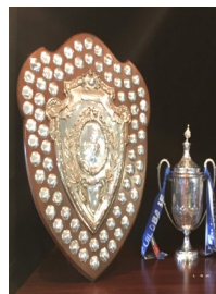
The club's 2017/18 trophies: the Hellenic League Premier Division Shield & the FA Vase

In 1989 Thatcham reached the last eight of the FA Vase, and in the same competition a record attendance of 1,400 was set when Aldershot Town won 1-0 at Waterside Park in 1993/94. However in 2017/18, Thatcham went all the way and rounded off a magnificent season by lifting the trophy at Wembley Stadium!